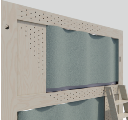
Privacy and light control