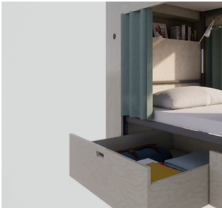
Safe storage of belongings